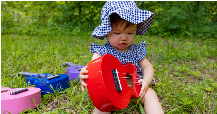
A new ukulele program for the children to teach them to praise Yah with song and dance.

Proverbs 22:6 Train up a child in the way he should go: and when he is old, he will not depart from it. Deuteronomy 11:19 You shall teach them to your children, speaking of them when you sit in your house, when you walk by the way, when you lie down, and when you rise up.