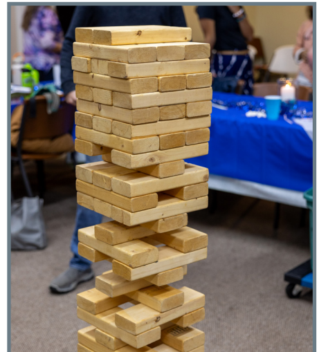
Something no one thought was possible happened at the last Qahal meeting. To find out more, check out page 2.

I hope and pray that through the Eldership endeavor, the saints will utilize the gifts that Yah wants them to, and we can come together as a more unified, better-functioning body.